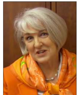
N.C. Psychiatric Association