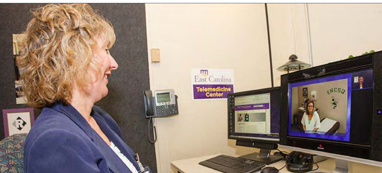
Telepsychiatry with the Eastern North Carolina School for the Deaf