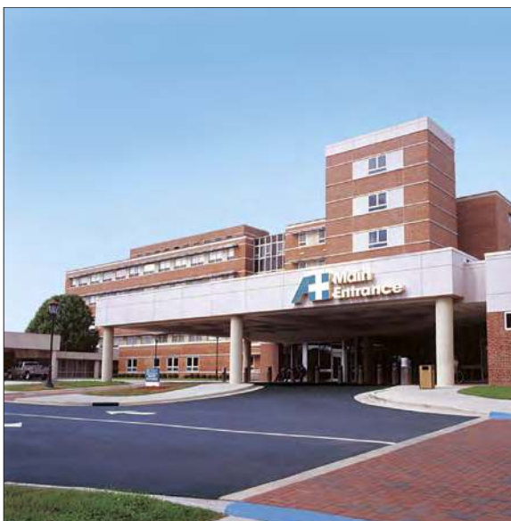
Albemarle Hospital in Elizabeth City

The result was an increasing number of uninsured patients arriving at the doors of the region’s hospital emergency rooms. Psychiatric lengths of stay for patients presenting to local emergency rooms with mental health issues began to burden the capacities of local hospitals. According to Donahue, many patients entering emergency rooms for psychiatric services only need a psychiatric